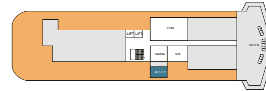
Deck 8 Gym Sauna Jacuzzi Spa Bridge