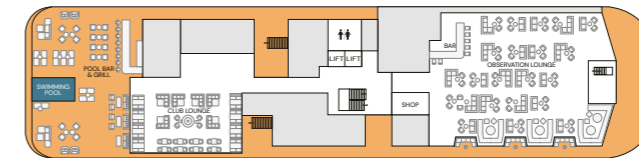
Deck 7 Shop Swimming Pool Pool Bar & Grill Club Lounge Observation Lounge