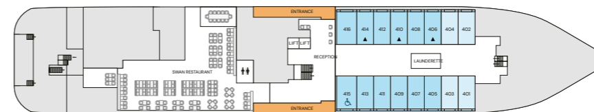
Deck 4 Reception Laundrette Swan Restaurant Oceanview Staterooms D4, M4