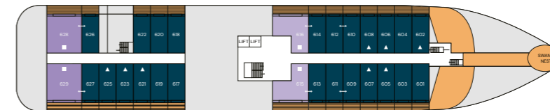
Deck 6 Premium Suites Suites Balcony Staterooms D6 Swan's Nest