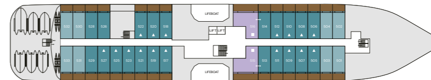
Deck 5 Balcony Staterooms D5, M5 Suites